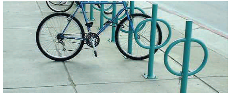
SHORT TERM STALLS