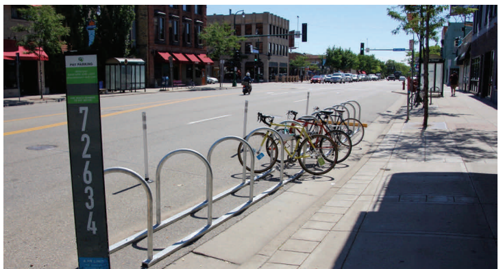
PUBLIC BICYCLE PARKING ADJACENT TO PROPERTY