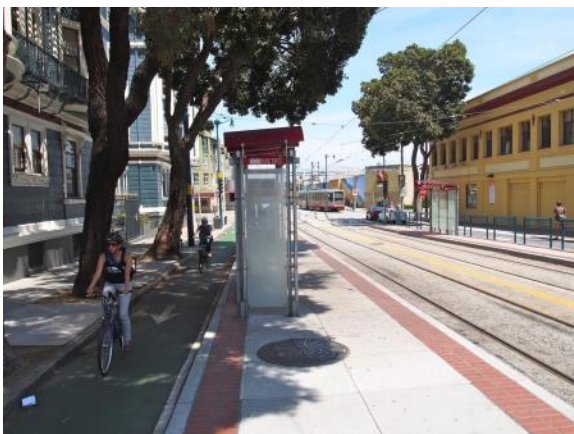
The bikeway may be routed behind bus stops to better manage interactions with pedestrians and buses