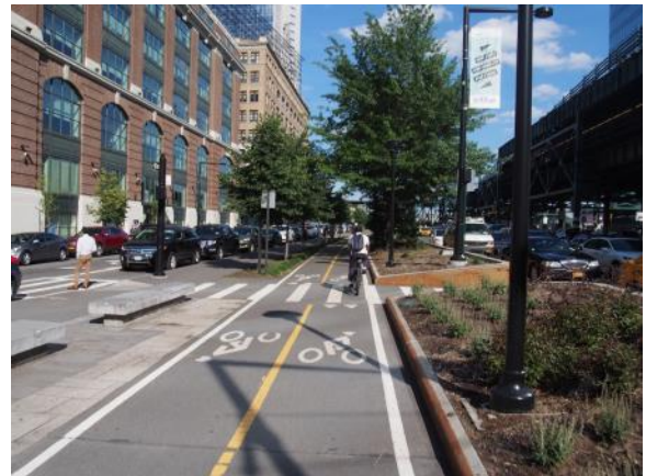
One-way or two-way bikeway that is raised at sidewalk level, similar to many trails in Minneapolis