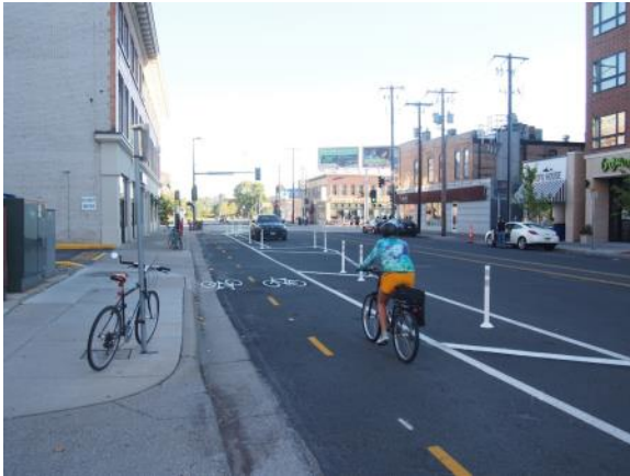
Two-way bikeway on the south side of University Avenue SE at street level