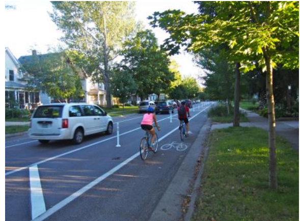
One-way bikeway on University Avenue SE and 4 th Street SE at street level