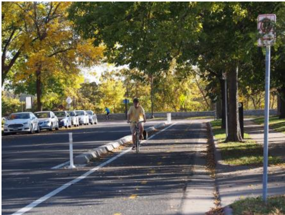
One-way or two-way bikeway at street level with more robust physical separation such as raised curb