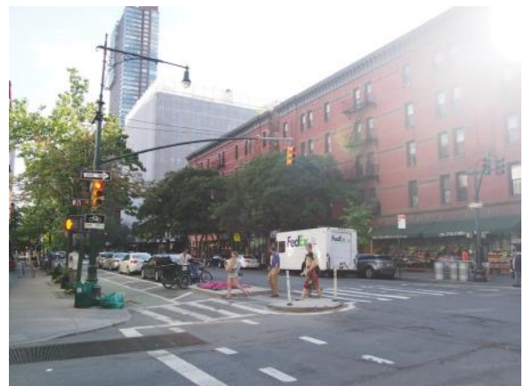
There may be opportunities to integrate pedestrian improvements into the bikeway design