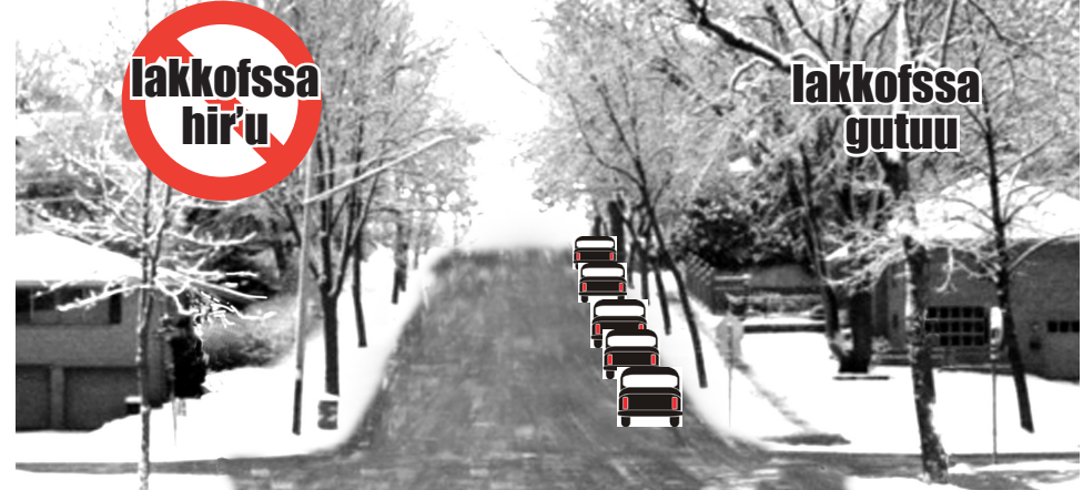
Example of non-Snow-Emergency-route street

Sa'aa 8w.d. Guyya 3 seeri dhabbi konkolata ni jalqaba