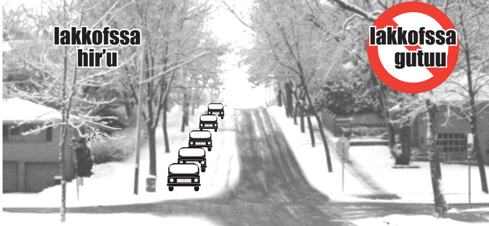
Example of non-Snow-Emergency-route street

Sa'aa 8w.d. Guyya 2 seera konkolata dhabu ni jalqaba.