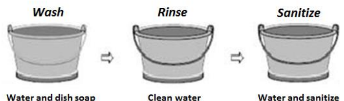
C. Utensil Washing Setup