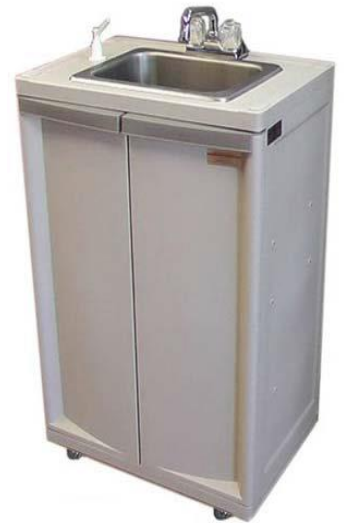
A. Hand Washing Setup