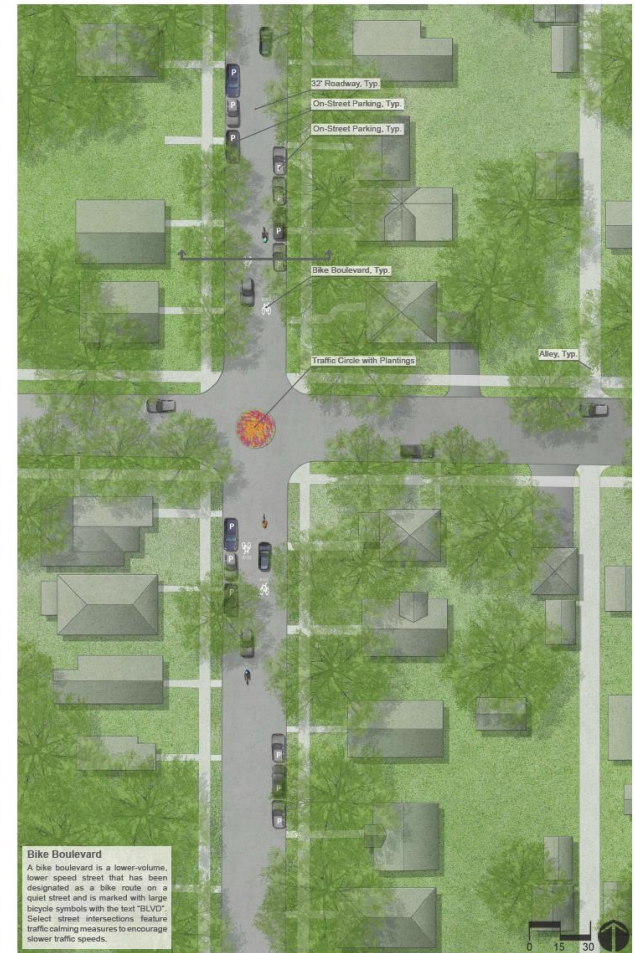
Greenway Type 4: Bike Boulevard