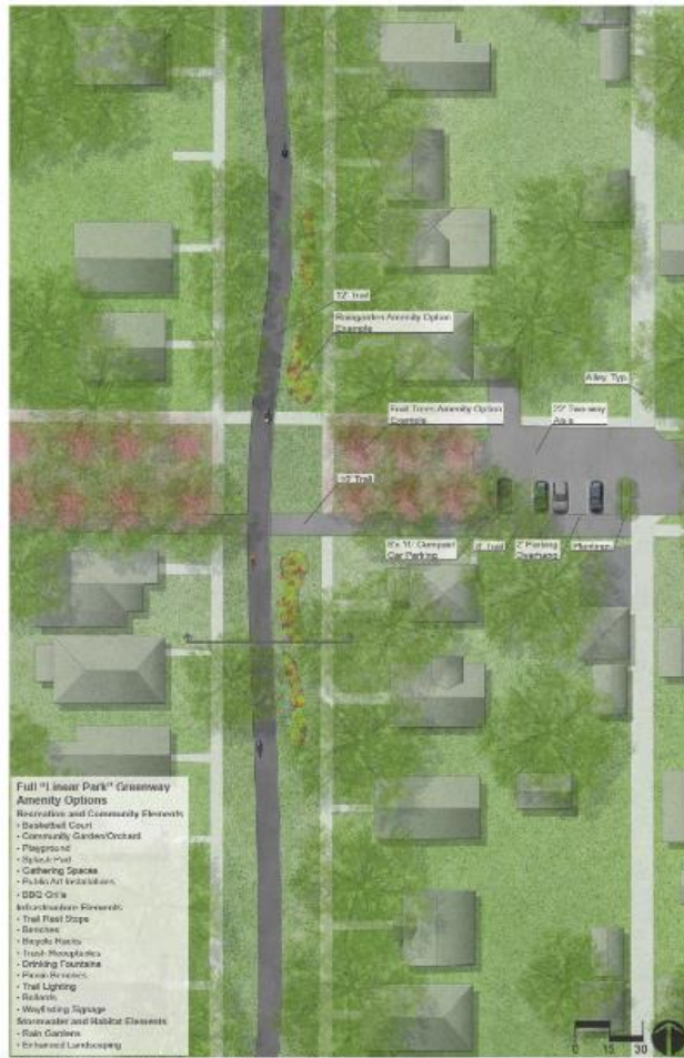
Greenway Type 1: Full "Linear Park" Greenway Design Opportunities