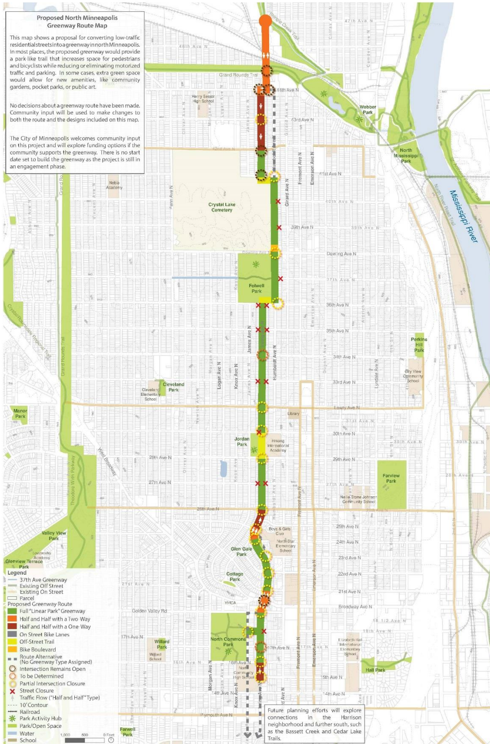
Proposed Greenway Route with Intersection Treatments NORTH MINNEAPOLIS GREENWAY

Funding for this project is provided in part by the Center for Prevention at Blue Cross and Blue Shield of Minnesota. March 4, 2014