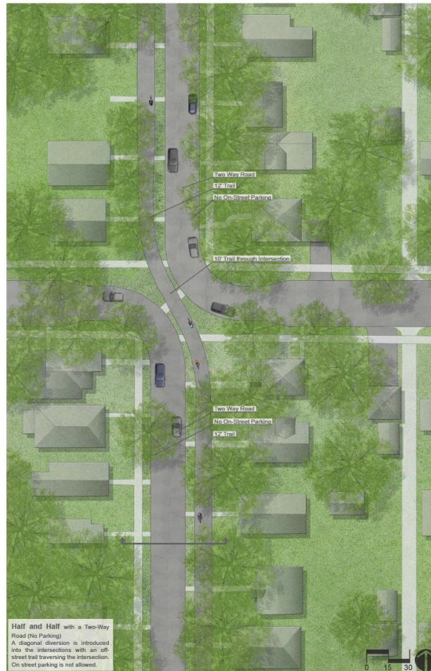
Greenway Type 2: "Half and Half" with a Two-Way Road (No Parking)