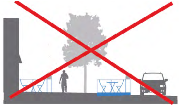
It is not acceptable to simultaneously have both a Sidewalk cafe directly adjacent to the building and a Street Cafe

Which configuration works best for you will depend on the sidewalk width and desired amount of seating.